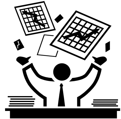
The Brokerage System