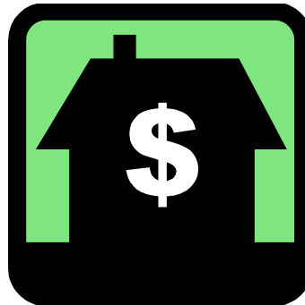
The MLS System